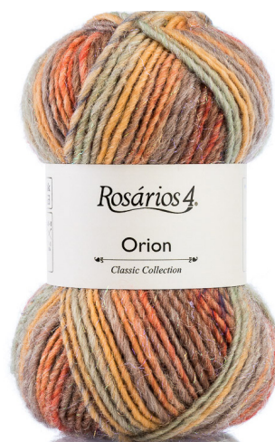
ORION Colour 05 (50% wool | 47% acrylic | 3% polyester)

#ROSARIOS4 #ORIONVEST #DONAMHANDMADE #ROSARIOS4ORION