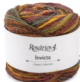
INVICTA Colour 13 (51% wool; 49% acrylic)