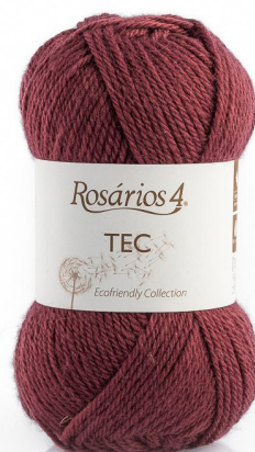
TEC Colour 06 (100% wool)

Rua das Grúas, 13 - Apartado 123 2485-059 Mira de Aire - Portugal Tel. +351 244 447 300 Fax +351 244 447 309 info@rosarios4.com www.rosarios4.com