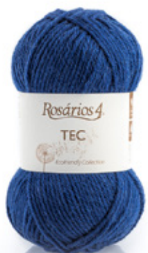
TEC Colour 32 (100% wool)

Rua das Grutas, 13 - Apartado 123 - 2485-059 Mira de Aire - Portugal Tel. +351 244 447 300 Fax +351 244 447 309 info@rosarios4.com www.rosarios4.com