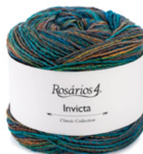
INVICTA Colour 25 (51% virgin wool, 49% acrylic)