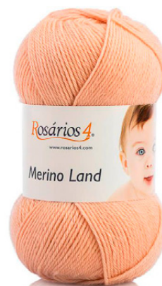
MERINO LAND Colour 35 (100% merino wool)

In garter stitch (knitting all rows): knit to the turning point, slip the first stitch purlwise with yarn in front and bring yarn to the front of work. Place the slipped st back on left hand needle, turn the work and knit.