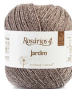
JARDIM Colour 49 (45% cotton; 55% merino wool - superwash)