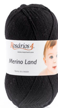
MERINO LAND Colour 25 (100% merino wool superwash)