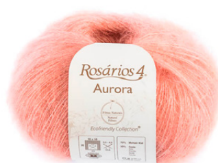
AURORA Colour 24 (70% mohair kid; 30% silk)