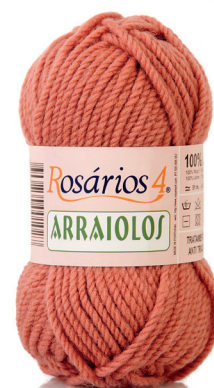
ARRAIOLOS Colour 541 (100% wool)