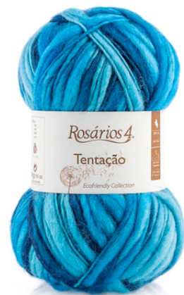
TENTAÇÃO TWEED Colour 45 (100% wool)