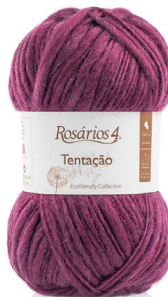
TENTAÇÃO Colour 29 (100% wool)