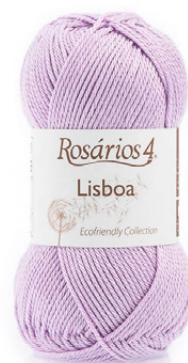
LISBOA Colour 25 (100% Mercerized Cotton)